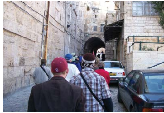
Streets of Jerusalem