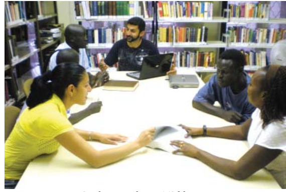
Students in the NETS library.

3-week intensive course: regular inter-term tuition rates apply