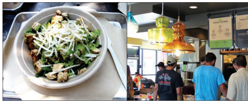
The create your own bowl gives lots of options. The layout is open, bright, and welcoming.

In a Chipotle fashion, the Fresh Griller staff moved your entree down a line of choices. Customers