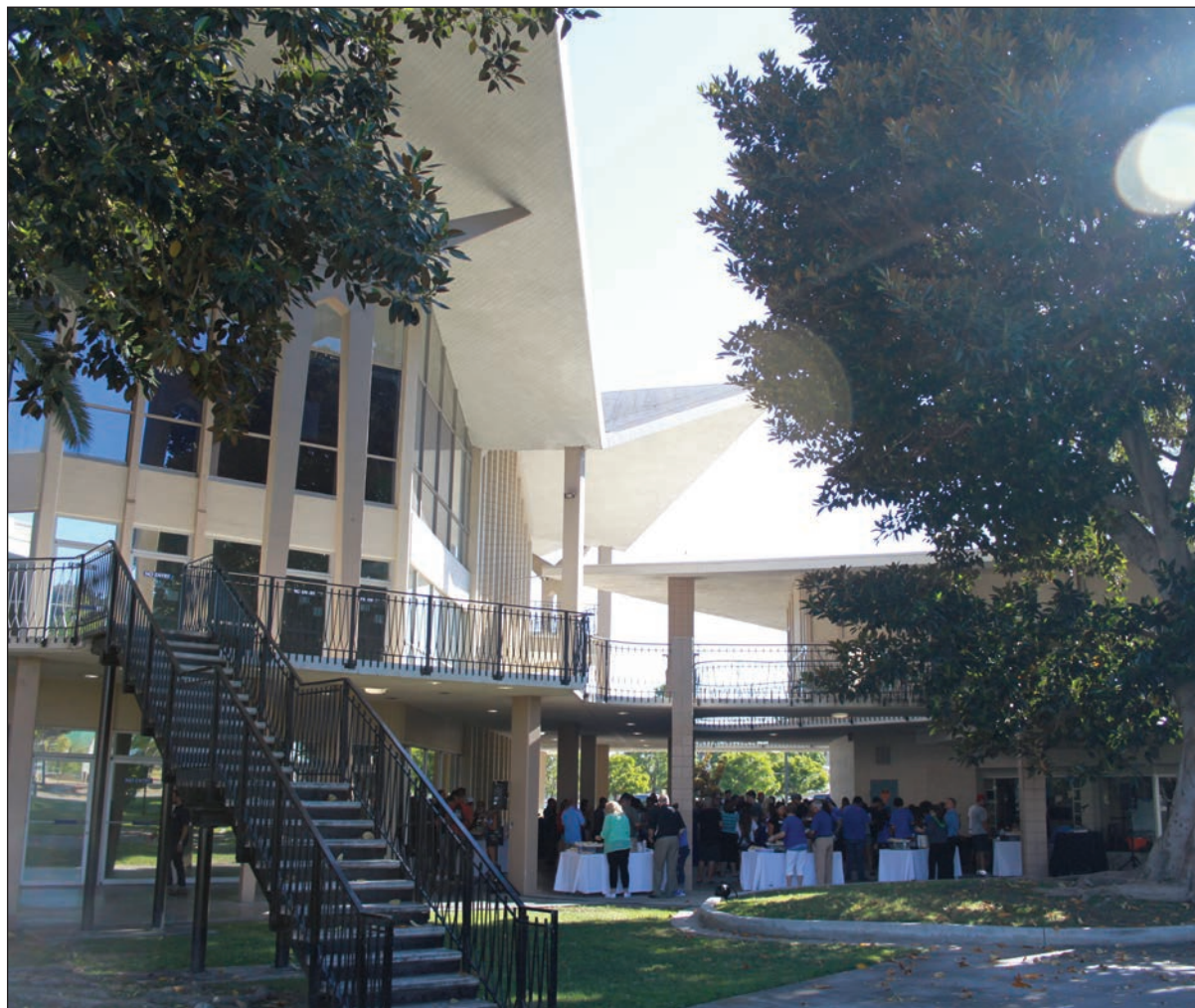
New students, along with family and friends, parted and said their goodbyes at the Farewell Celebration the first day of NSO Saturday, Aug. 15. Events have continued through the week and will end tomorrow with Clash-N-Bowl.

NSO concludes with Karaoke Jam tonight in the Lambda Lounge at 8 p.m. The next day for Clash-N-Bowl students will meet outside the Student Center at 8 p.m. for the Clash Off and the bus leaves at 9 p.m. for the event.