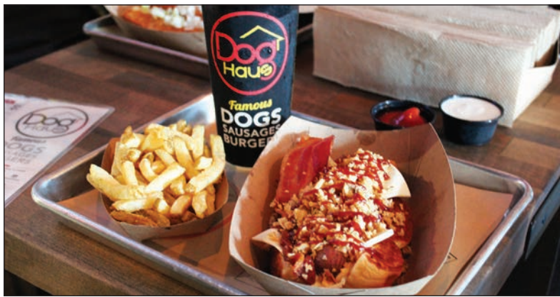
The Cowboy combo comes topped with crispy onions.

The spicy Italian sausage had a nice kick, but was not overly spiced and the